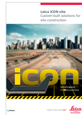
Leica iCON site Brochure