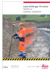
Leica iCON gps 70 Series Brochure

Illustrations, descriptions and technical data are not binding. All rights reserved. Printed in Switzerland – Copyright Leica Geosystems AG, Heerbrugg, Switzerland, 2024. 959264 en – 09.24