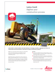
Leica ConX Flyer