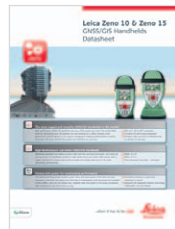
Leica Zeno GNSS/GIS Handhelds Datasheet

Illustrations, descriptions and technical data are not binding. All rights reserved. Printed in Switzerland – Copyright Leica Geosystems AG, Heerbrugg, Switzerland, 2012. 774509en-us – 12.13 – galledia