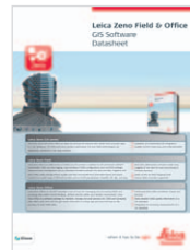
Leica Zeno Software Datasheet