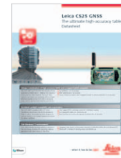
Leica CS25 GNSS Datasheet