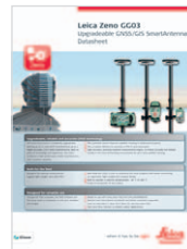
Leica Zeno GG03 Datasheet