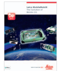
Leica MobileMatrix Brochure