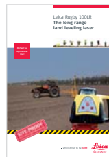
Leica Rugby 100LR The long range land leveling laser