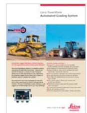
Leica PowerBlade Automated Grading System