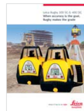
Leica Rugby 300 SG & 400 LG