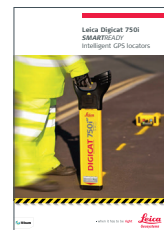
Leica Digicat 750i Smartready