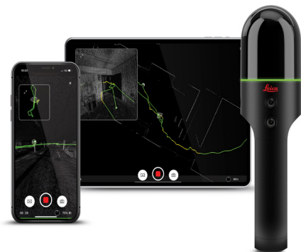
Leica BLK2GO handheld imaging laser scanner and Leica Cyclone FIELD 360 mobile-device app.

Download from Google Play Store and Apple App Store.