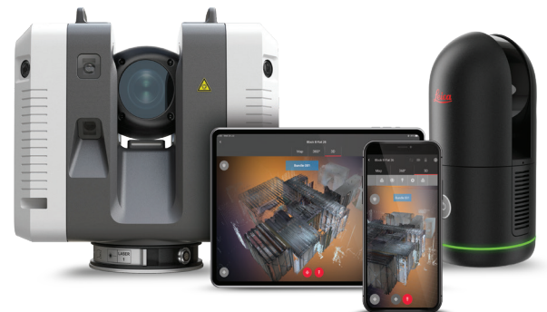
Leica RTC360 3D laser scanner with the Leica BLK360 imaging laser scanner and Leica Cyclone FIELD 360 mobile-device app.