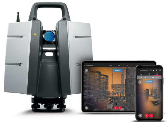
Leica ScanStation survey-grade, 3D laser scanner and Leica Cyclone FIELD 360 mobile-device app.

For first generation BLK360 scanners, iOS devices are recommended.